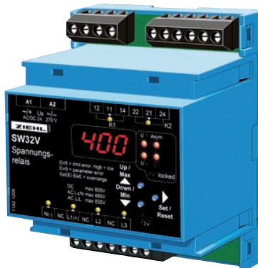
SW 32 V

The voltage-relay SW32V is a high-grade voltage monitor with a wide measuring-range for monitoring DC-, AC- and 3-phase voltages for over- and/or undervoltage.